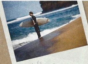
Your Next Adventure