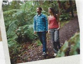
Your Next Morning walk to remember