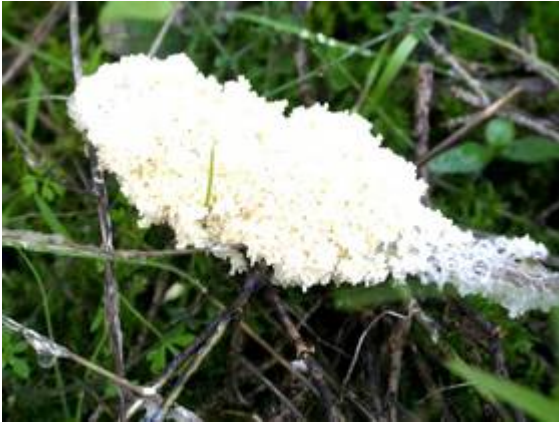
Slime Mould found at Pt.Roadknight

Have you ever heard of Slime Moulds or Water Moulds? Probably, without realising it, you have, at least the latter.